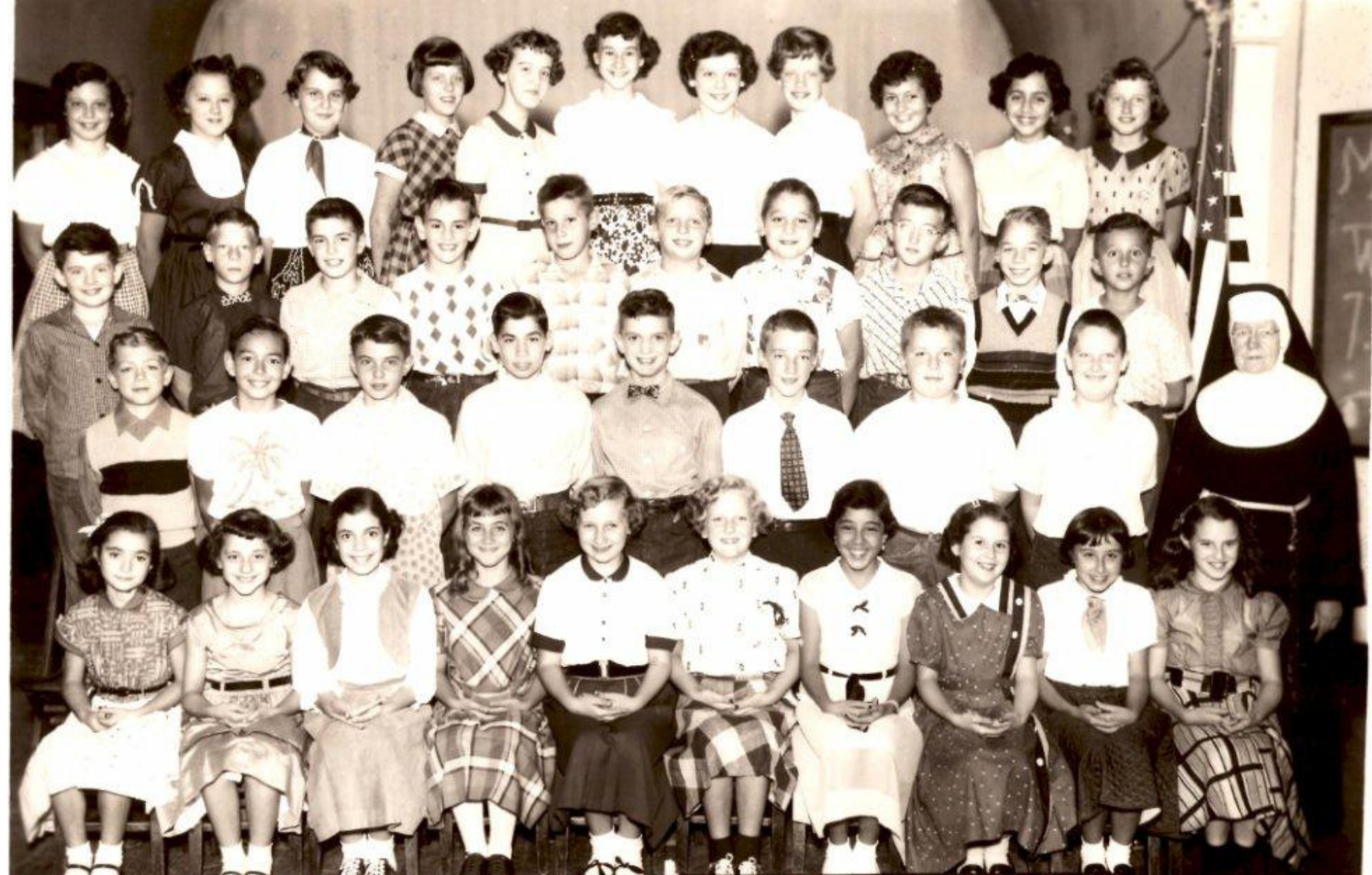
ST ANN SCHOOL GRADES 5&6 SEPT 1954