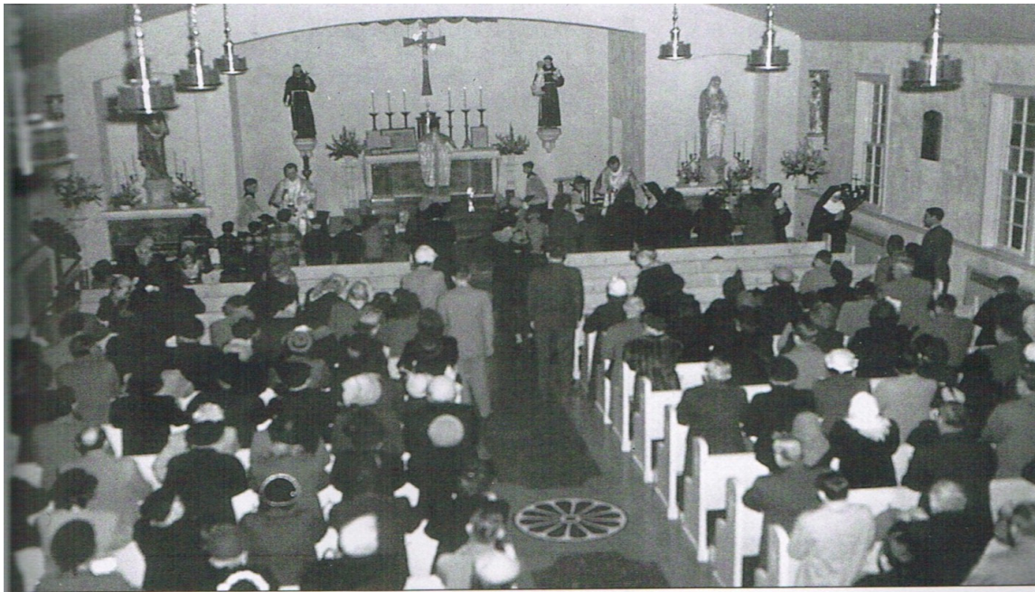
St. Ann's Church, at Chicago Road and Main Street, is pictured at Communion time in the 1950s. After the Second Vatican Council, Catholic altars were repositioned to face the congregation while communion rails were eliminated. This congregation, which included many German Americans, was devastated when the church was ordered closed in the early 1990s.