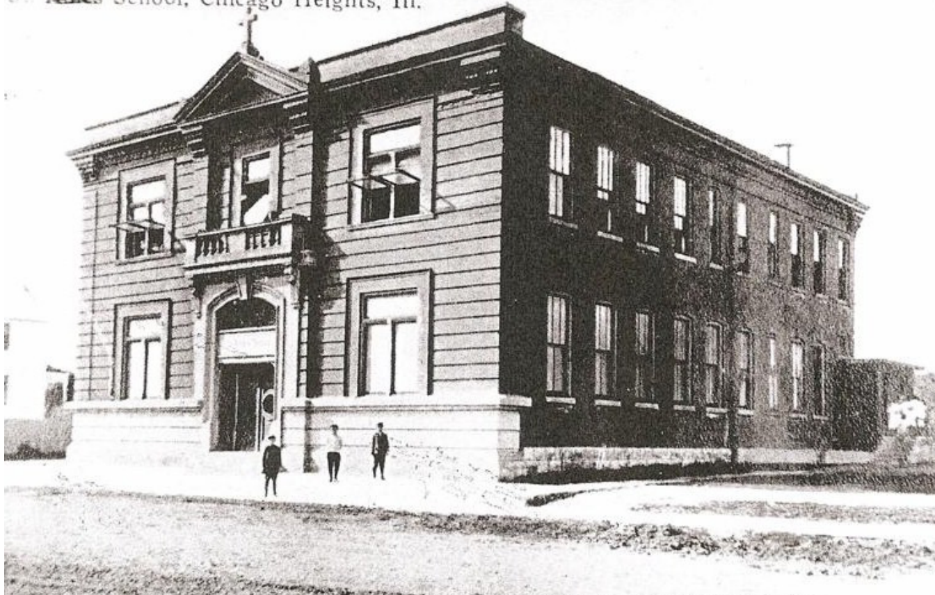
St. Annes School, Chicago Heights, Ill.