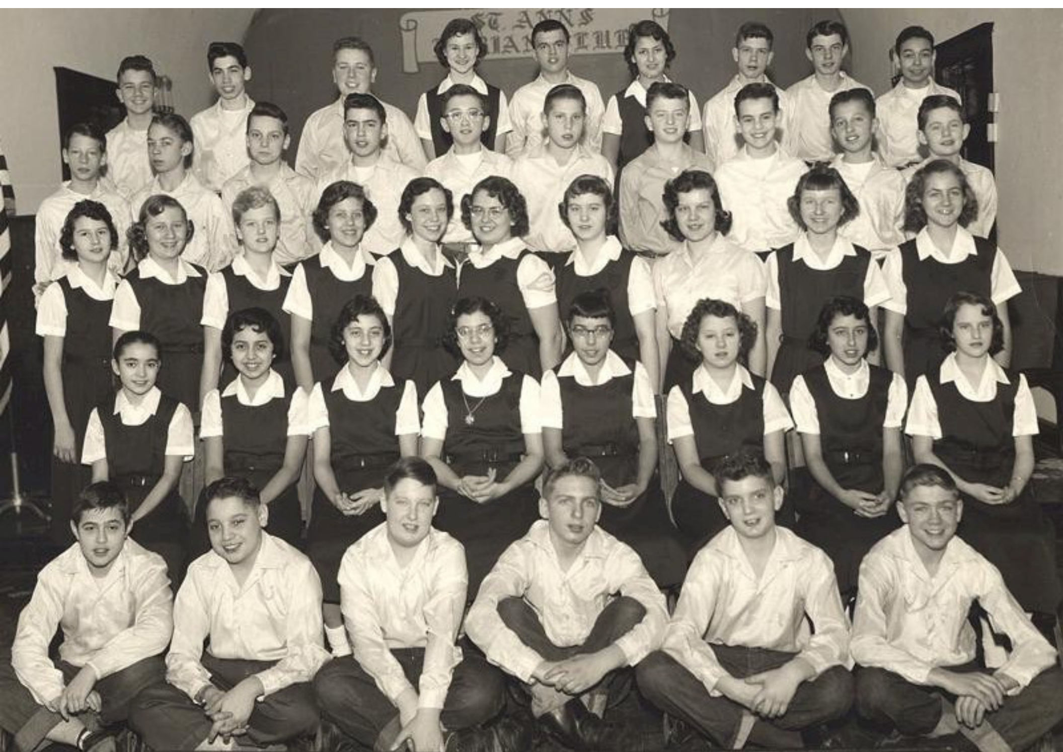
ST ANN SCHOOL GRADE 7 & 8 JAN 1957